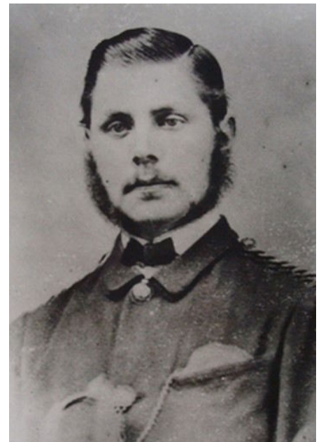
Ensign John Thornton Down VC

The final attack was deferred until the 25th March 1864, when a force comprising the 57th, 70th and local militia plus an artillery unit of four guns, moved to within