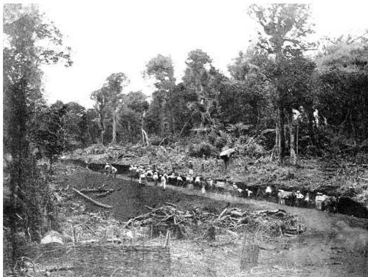
12th & 14th Regiments building Great South Road. Pokeno Hill (Razorback), 1862

The Trust always needs more active members, so please contact Ian Barton:- 09 239 2049, if you have an interest in the project.