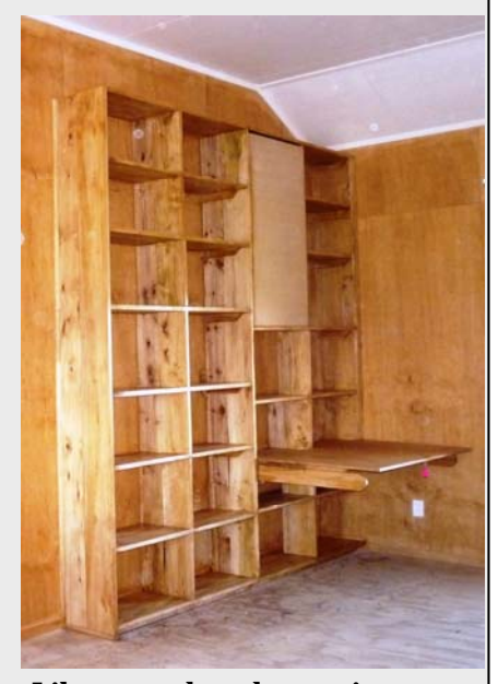
Library and study area in corner of workroom