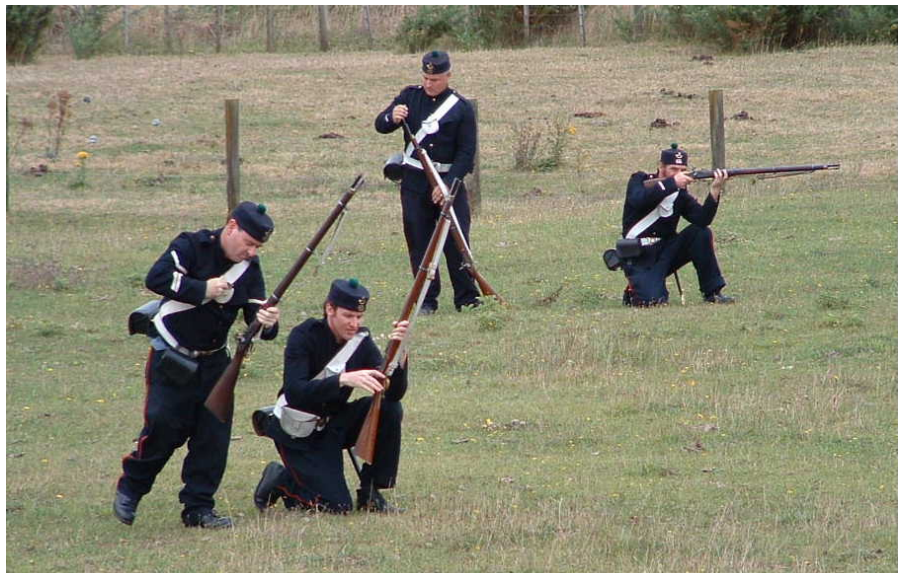
Demonstration by 65th Re-enactment Group at Queen's Redoubt -March 2007