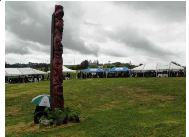
One the commemorative pou erected at Rangiriri. They will be very visible from the new motorway beside the Waikato River.

of our Trust, which is to erect a memorial in remembrance of the New Zealand Wars. It is currently intended that this be in the form of a whakamaharatanga, a memorial to commemorate those who fell in the New Zealand wars between 1845 and 1872. It will differ from other memorials of this event in that the names of all who fell, Maori and Pakeha, will be recorded in some way.