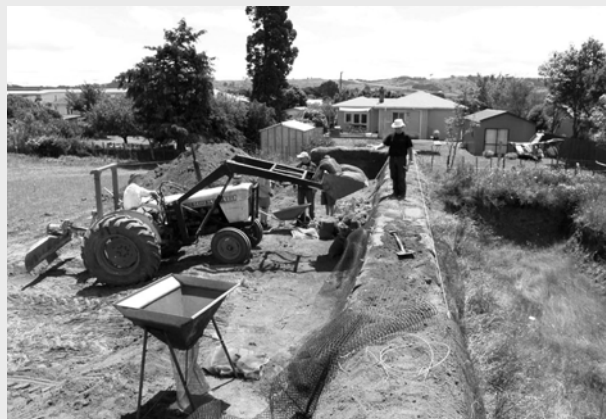
North end of east wall under construction; Dec 2008