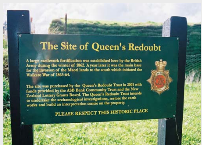
Sign at entrance to Queens Redoubt