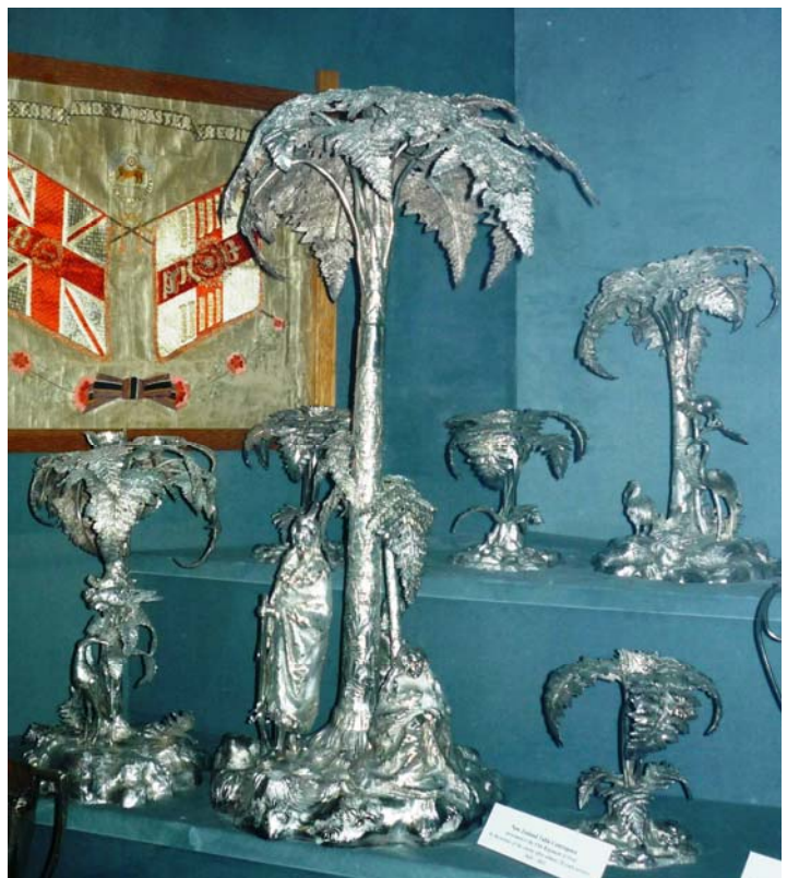
65th Regiment -The Colours with the silver table centrepiece presented by the citizens of NZ to the Regiment when it left NZ in 1865. (held in the York & Lancaster Regimental museum, Rotherham)