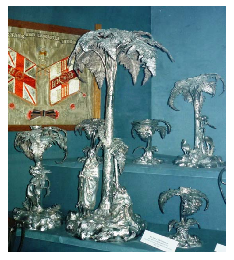
65th Regiment -The Colours with the silver table centrepiece presented by the citizens of NZ to the Regiment when it left NZ in 1865. (held in the York & Lancaster Regimental museum, Rotherham)

During visits to UK in 2006 and 2009 I visited the museums of the 12th, 14th and 65th Regiments plus that of the Royal Engineers. These visits have yielded useful information about the period which those units spent in NZ during the latter part of the 19th century; so I am intending to make another visit, early next year, to visit the museums and archives of the remaining eleven units . Some early contacts with these have already yielded previously unknown information (see the article about "Pokeno" on page 2) so I am hopeful that this final visit will give us even more useful information. The ultimate aim is to place all information, photographs and books into a library; to be created in the new display area of the barracks soon to be erected.